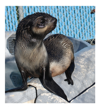
Skittles enjoying the sunshine in one of the outside pens.

On a smaller note, the latest admission to the NMMC was a 10 pound Northern Fur Seal pup that was affectionately named Skittles by rescue staff. She was rescued in Trinidad on November 6th. Her rehabilitation is going well. She is eating fish and has gained 3 pounds over the last month. Ultimately, she will most likely be transferred to The Marine Mammal Center in Sausalito for release.