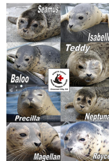
Class of 2009

Remember that all proceeds go to help rescue and rehabilitate animals along the coastline of Humboldt and Del Norte counties.